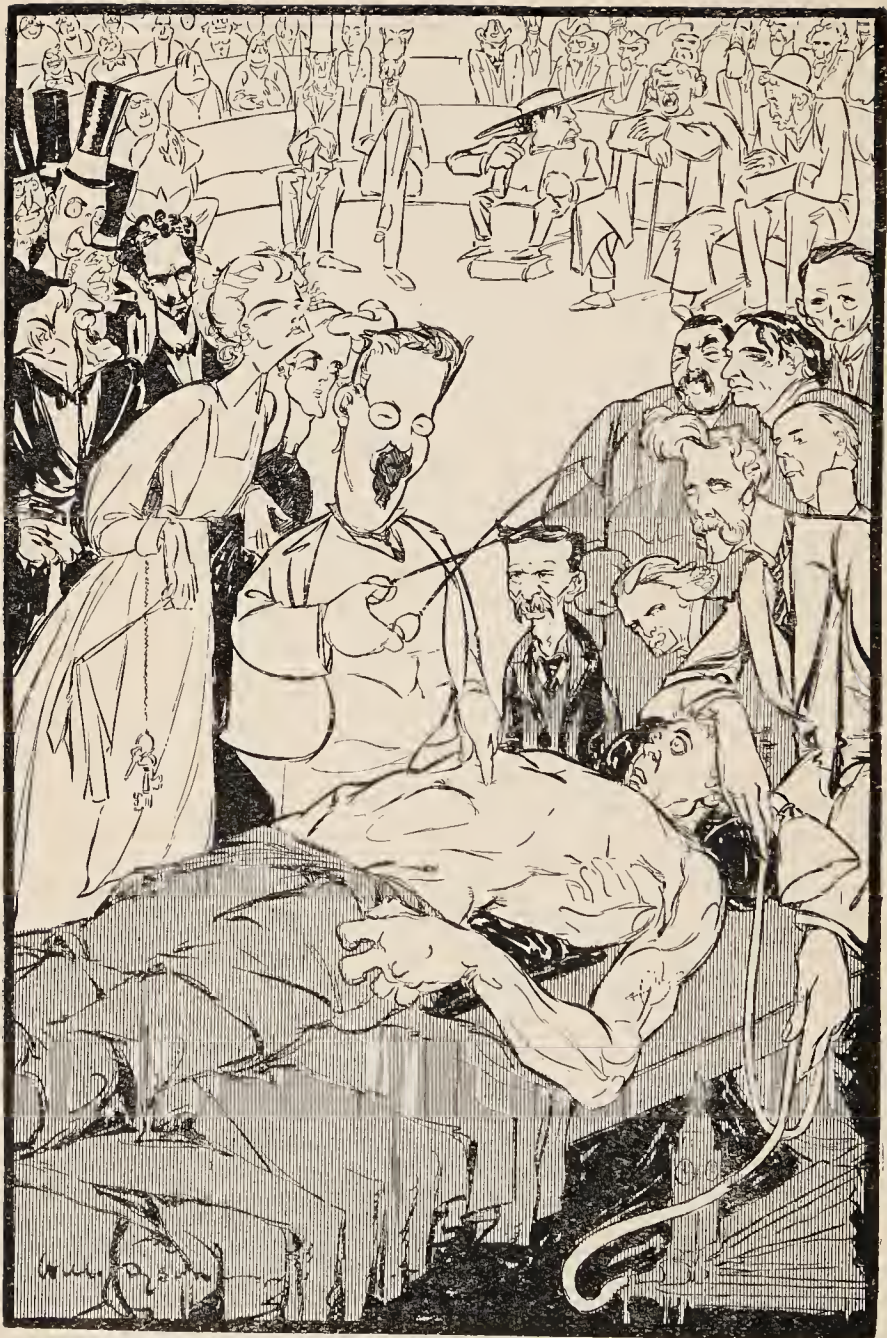
LABOUR'S MEDICAL ADVISERS A DEMONSTRATION IN THE NEW STATESMANSHIP